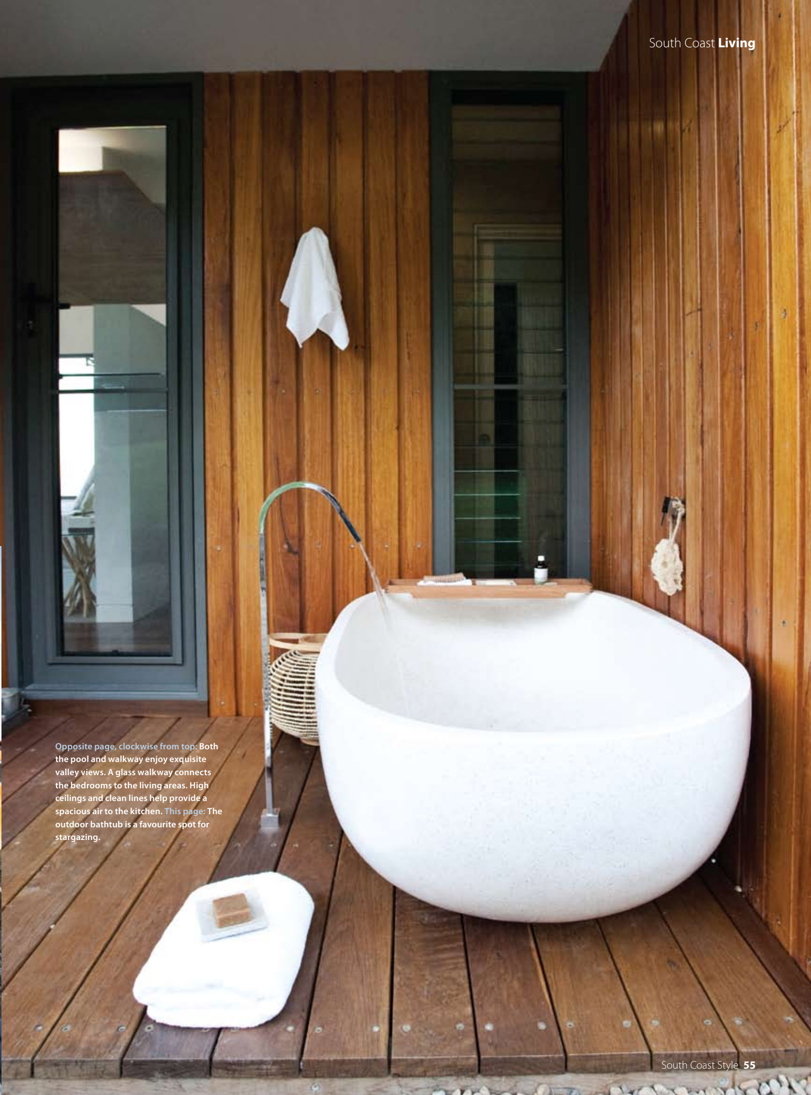
Opposite page, clockwise from top: Both the pool and walkway enjoy exquisite valley views. A glass walkway connects the bedrooms to the living areas. High ceilings and clean lines help provide a spacious air to the kitchen. This page: The outdoor bathtub is a favourite spot for stargazing.